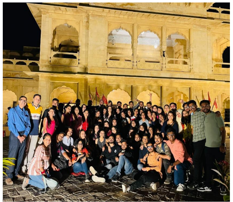
HOTEL DESERT PALACE