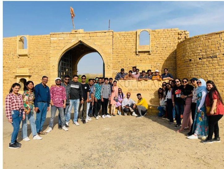
KULDHARA VILLAGE (GHOST VILLAGE)

Post lunch students headed to the Kuldhara Village, Jaisalmer also known as Ghost Village / Abandoned Village where the guide at the site briefed students, faculty members, and tour guides about the history of the village. After the briefing, the group explored the abandoned village, which has become a tourist attraction. The dilapidated houses, temples, and other structures provided a glimpse into the lives of the villagers who once lived there. Overall, it was a fascinating and educational experience for the students and faculty members, giving them an insight into the history and culture of the region.